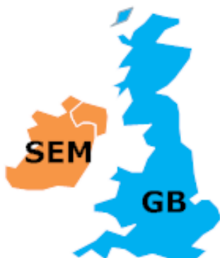
Figure 7: SEM and GB Bidding Zones

A geographical overview of the bidding zone delineations is given in following figure: